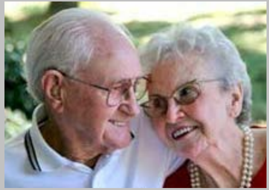
LIVING HEALTHY WITH COPD

Take time to think about your lungs.....learn about COPD!